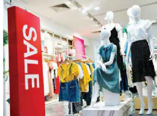
Structural Point of Purchase Slip over graphics, multi-sided ceiling hangers, display wraps