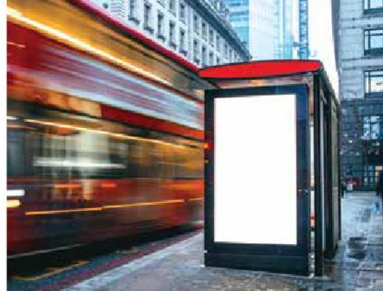
Bus shelter, airport and other O.O.H .010 Imagemax® for backlit use