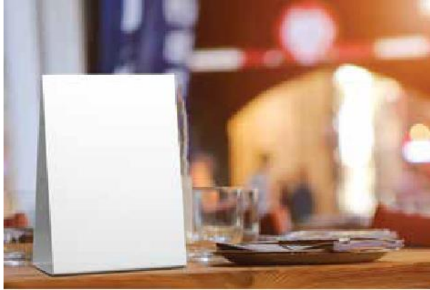
Table Tents, Ceiling Hangers and Case Cards Score and Fold for structural use