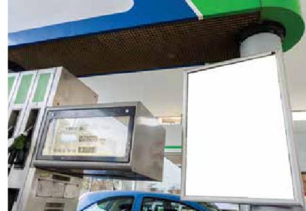
Short term Fuel Service Signage outdoor/undercover, in-frame, slip-in