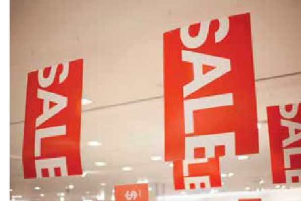
Ceiling Hangers .020 and higher is dead white block-out Double Sided hangers, hangs from holes