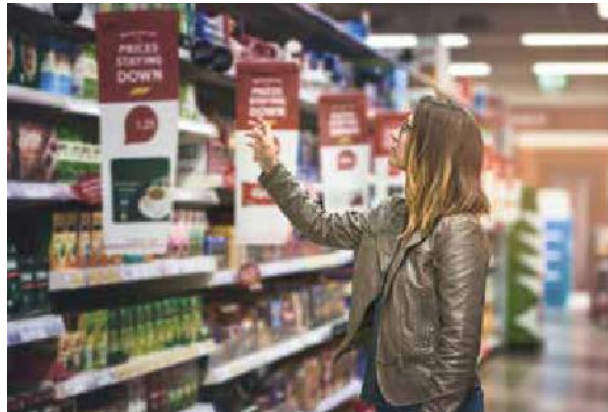
Grocery Store Applications Aisle markers, produce dividers, ceiling hangers, specialty dangles, case cards