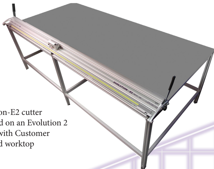
Evolution-E2 cutter Installed on an Evolution 2 Bench with Customer supplied worktop

The cutter can be easily be installed onto the bench without installing the worktop first. Only one \frac{3}{4} " thick worktop is required to bring the top level to the Evolution-E2 cutter's base.